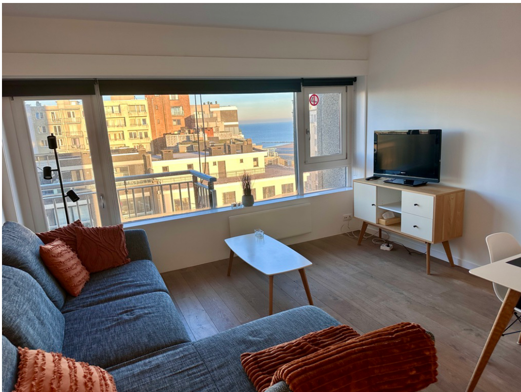
view from living room towards beach & sea

all mattresses have protectors, see that you do not accidentally take them with you when taking off the sheets