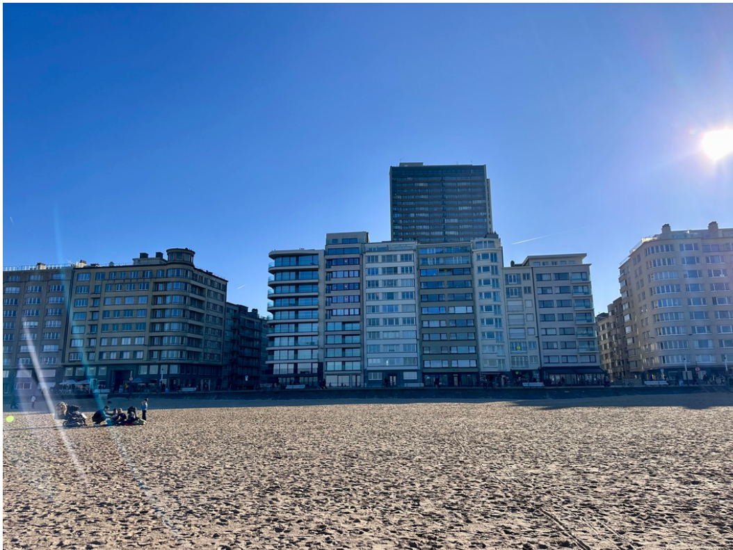
view of the Europatoren from the beach

2 bedroom apartment on the tenth floor with an elevator, modern equipped kitchen, digital TV, internet and a full width terrace with sea view