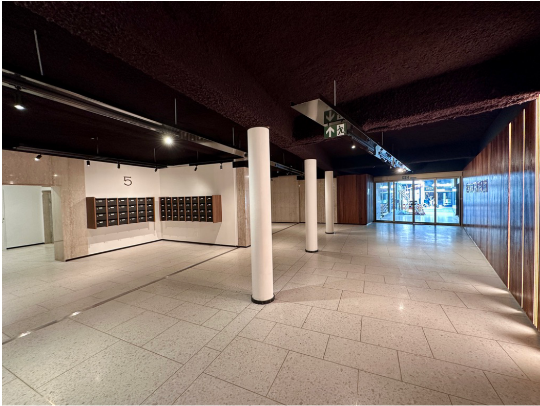
ground floor entrance and tower 5