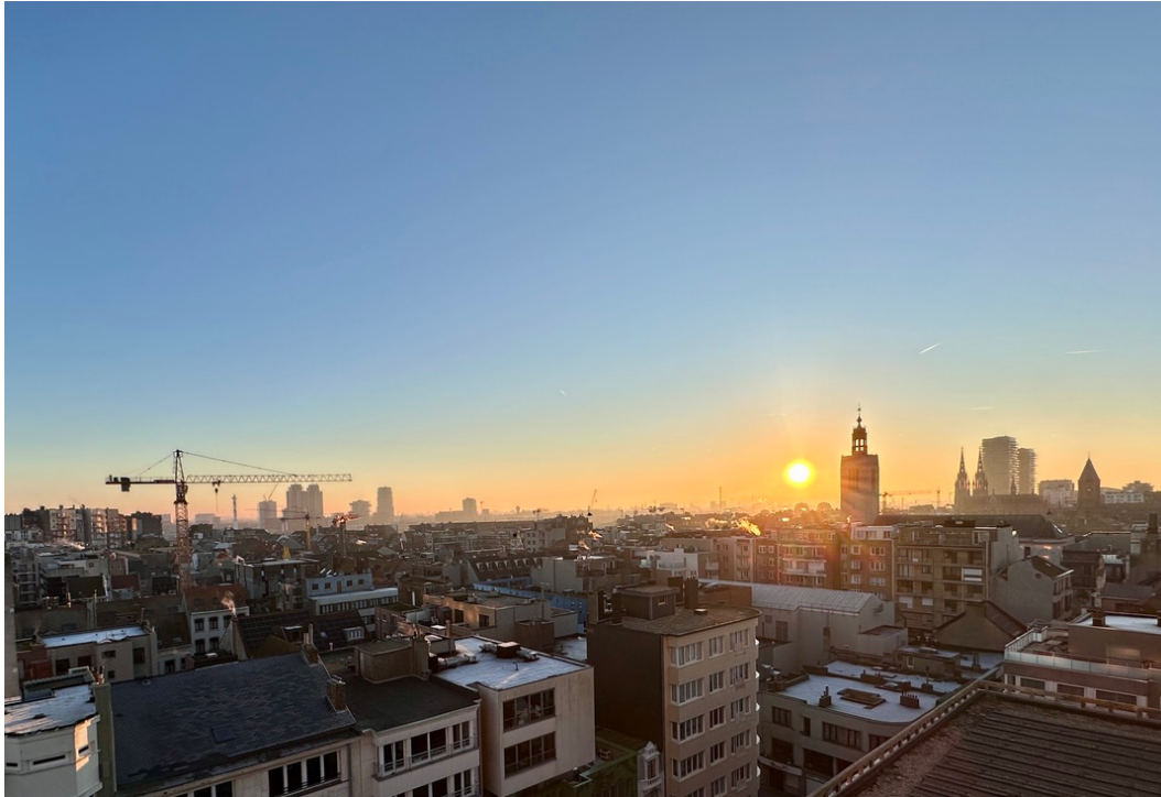
view from bedroom back over downtown, at sunrise